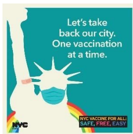
Illustration of the Statue of Liberty wearing a face mask and a band aid on its arm. Text reads: Let's take back our city, one vaccination at a time. NYC Vaccine For All: Safe, Free, Easy.

Illustration of the Statue of Liberty wearing a face mask and a band aid on its arm. Text reads: All in-favor of a COVID-19 vaccine, raise your arm. NYC Vaccine For All: Safe, Free, Easy.