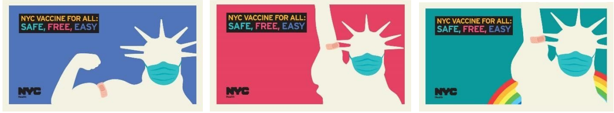
Illustration of the Statue of Liberty wearing a face mask and a band aid on its arm. Text reads: NYC Vaccine For All: Safe, Free, Easy.